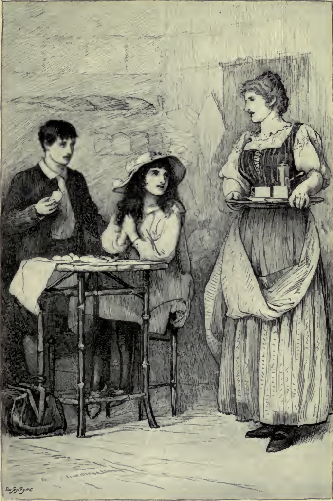
'She . . . presently brought back two good cups of hot coffee.'